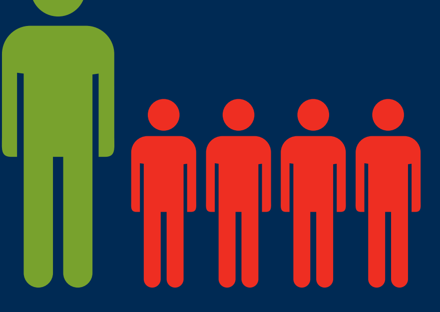
One adult to four 5-10yrs